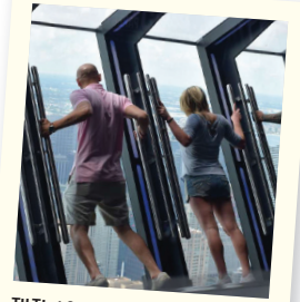
TILT! at 360 Chicago