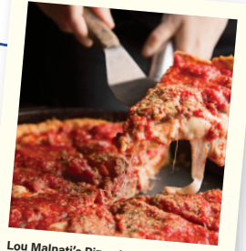
Lou Malnati's Pizzeria

Many places have reopened with limited capacity, new operating hours or other restrictions. Inquire ahead of time for up-to-date health and safety information.