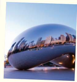
Cloud Gate in Millennium Park