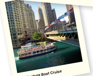
Architecture Boat Cruise

Grab an iconic Chicago snack while you explore the city. Visit Illinois Made Maker Garrett Popcorn Shop for a taste of their famous Chicago mix – a delicious blend of cheese and caramel popcorn. While there's plenty to keep you entertained downtown, exploring further north you'll find the impressive (and free) Lincoln Park Zoo . Sports fans should continue to Wrigley Field for a pic with the iconic marquee or head to the United Center for the Michael Jordan Statue .