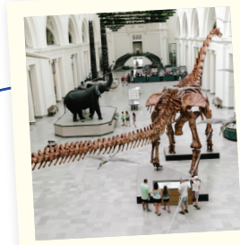
The Field Museum