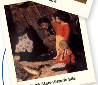
Black Hawk State Historic Site