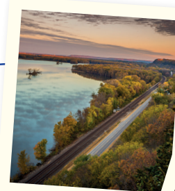
Mississippi Palisades State Park