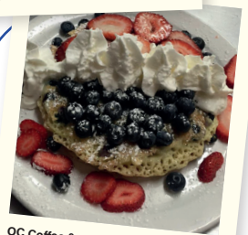
QC Coffee & Pancake House