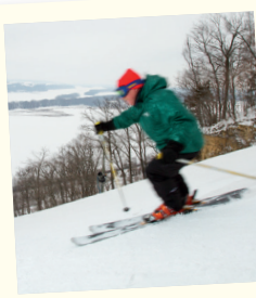
Chestnut Mountain Resort