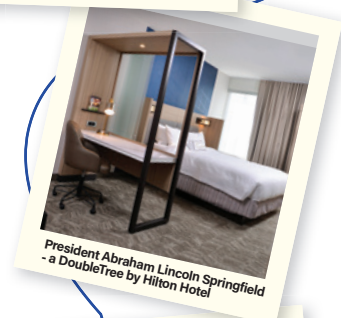
President Abraham Lincoln Springfield - a DoubleTree by Hilton Hotel