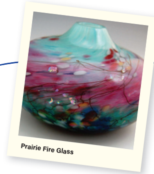
Prairie Fire Glass