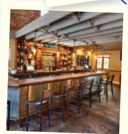
Obed & Isaac's Microbrewery and Eatery