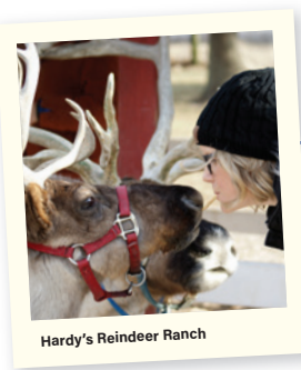
Hardy's Reindeer Ranch

Once you're in Monticello, check out Illinois Maker Prairie Fire Glass , which creates one-of-a-kind, handcrafted jewelry, ornaments and vases – which are ideal stocking stuffers and hostess gifts. As the sun starts to go down, experience the holiday magic of the Allerton Park & Retreat Center's illuminated winter walk, where you'll follow a beautiful, meandering path through the park grounds lined by twinkling lights.