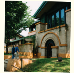
Dana Thomas House